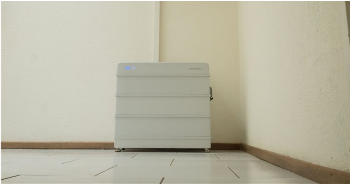
Sungrow installed inverter.

As load shedding continues to disrupt daily life, selecting the right backup power solution is vital for ensuring energy independence and uninterrupted functionality. Sungrow's residential solution addresses the key criteria for a reliable and sustainable backup power system. By integrating solar power, efficient energy storage, and intelligent energy management, Sungrow empowers consumers to take control of their energy needs.