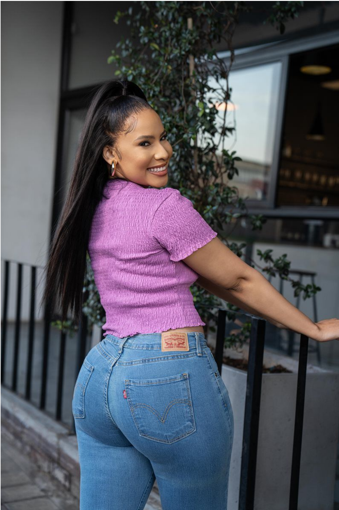
Thuli Phongolo in the Levi's Curvy range.

Phongolo and the denim brand have partnered once again for the 2023 edition of the Curvy campaign.